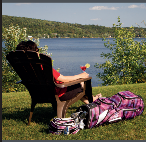
GOLF PACKAGE 2 NIGHTS AND MORE